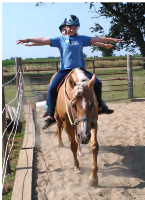
Students having fun on Brandy